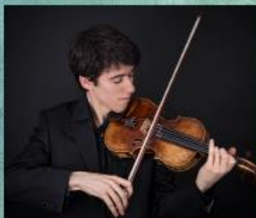
EMMANUEL BACH -VIOLIN SATURDAY 4 JUNE 4.30pm