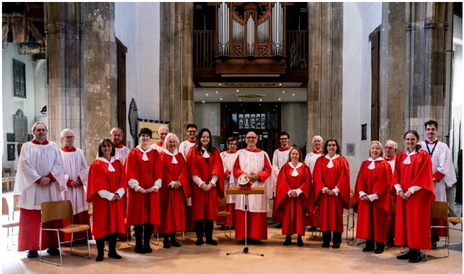
The choir pictured at Chelmsford cathedral in April.