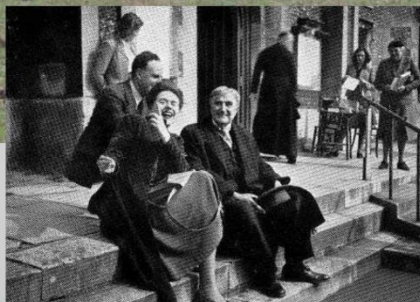
Ralph Vaughan Williams with Ursula Wood outside St Martin's Church, Epsom in 1947.