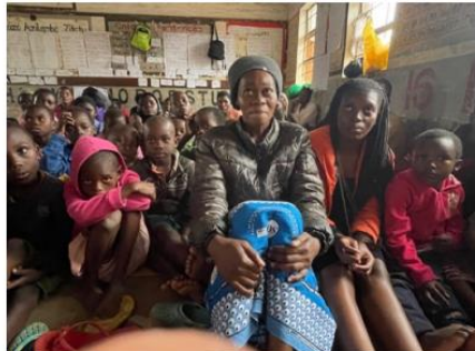
Mothers and children room