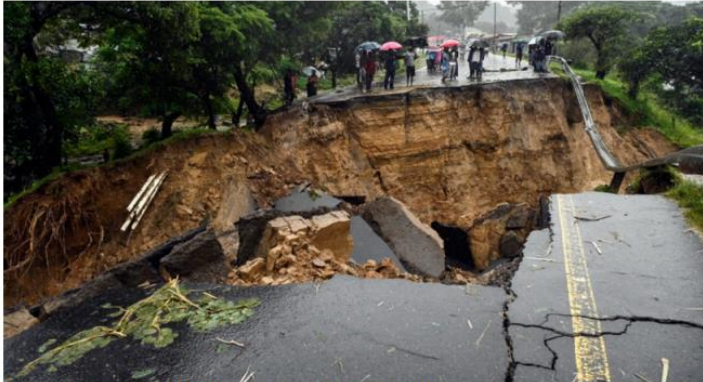
Road from Blantyre to Chilimba. (10 mins from house).

The main affected areas were Blantyre City, Blantyre District, Chikwawa, Chiradzulu, Machinga, Mulanje, Neno, Nsanje, Phalombe, Thyolo, Zomba City and Zomba District. At least 500,000 people are displaced. Malawi was already suffering from a prolonged Cholera outbreak and health authorities have warned of an increased cholera risk due to damaged water systems and toilets.