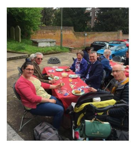
Food brought and shared at our Big Lunch