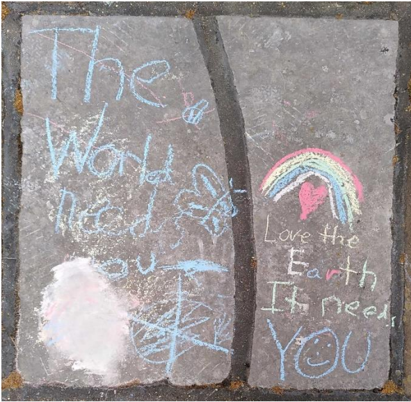
Chalk art on the piazza