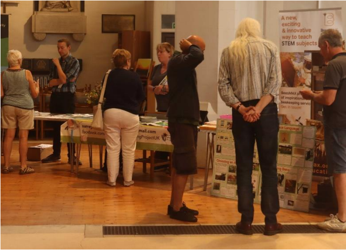
Conversations at the Fair.