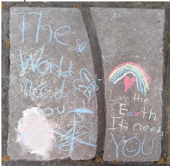
Chalk art on the piazza