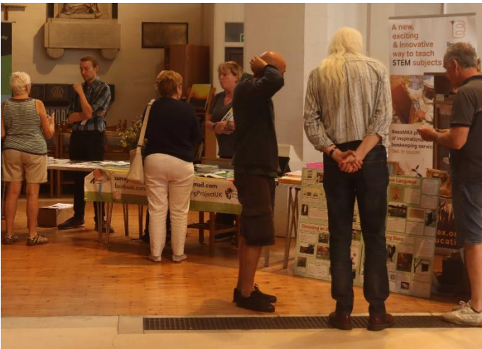
Conversations at the Fair.